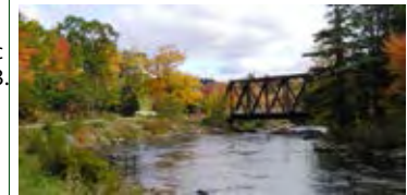
Steel trestle bridge at Cable Pool

Cable Pool, now a town park, is a historically significant salmon pool. It makes a great picnic spot.