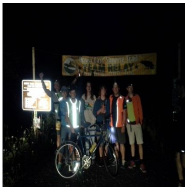
Ready for the Night-Time Relay Race