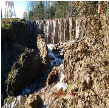
Charlie's Niagara Falls

Again this year the entire trail was mowed along the sides, with grading and rolling occurring between Mile 29 and Mile 71. There were some areas that have been problematic washouts this fall with all the heavy rains we had. Beaver activity was slow until about mid to late October, then after that it was difficult to keep up with them as they were moving to new locations, building dams, new huts, plugging culverts, and generally preparing for winter. At one particular site, I lost the battle with them and as a result had a major washout (see photo) that took three days and around $8,000 to repair.