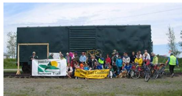
Celebrating Trails Day in Machias

June 2, 2007, in Machias was a day to remember, as the Sunrise Trail Coalition celebrated the imminent construction of the trail. After a few words of greeting in front of the depot and boxcar (special thanks to Senator Damon), the group paraded down Main Street,