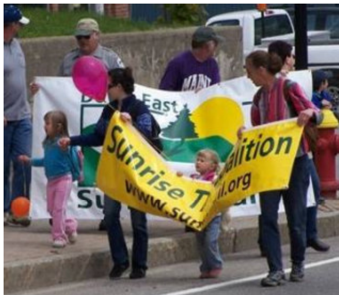
Machias Trails Day Parade

In March, I was hired by the Maine Department of Conservation (MDOC), Bureau of Parks and Lands