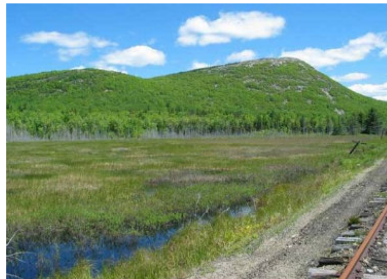
Schoodic Bog and Schoodic Mountain