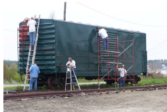
Washington County Jail Crew Renovate Box Car